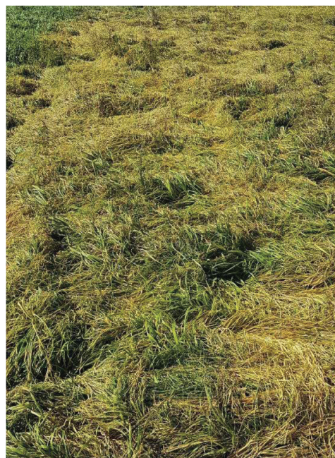
Sharpen + ESO + glyphosate